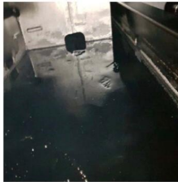
TANK INSIDE WITH REMAINING OIL